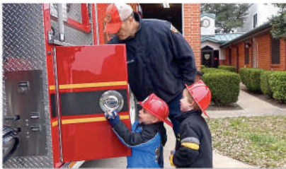
DAILY LIFE TRIPS