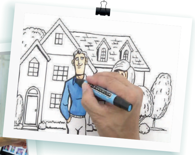
Kids Character Development and animation