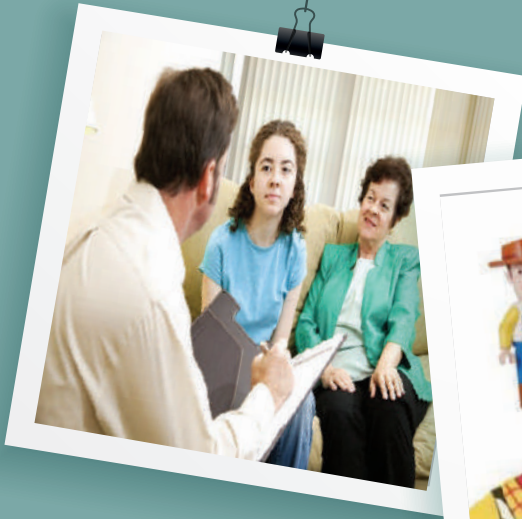
Kids Marketing Research