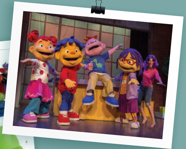
Character Live International Shows