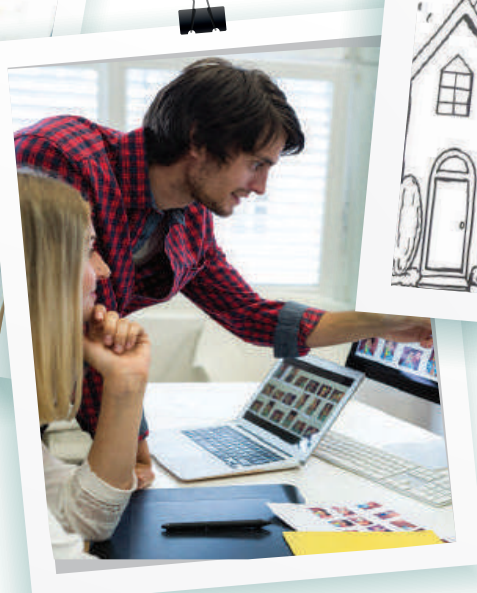
Kids Designing & Branding