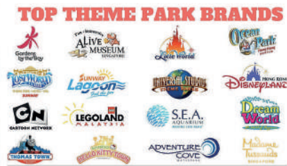
TOP THEME PARK BRANDS